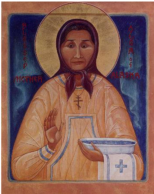
Mother Olga the Midwife Icon (written by Bess Chakravarty)