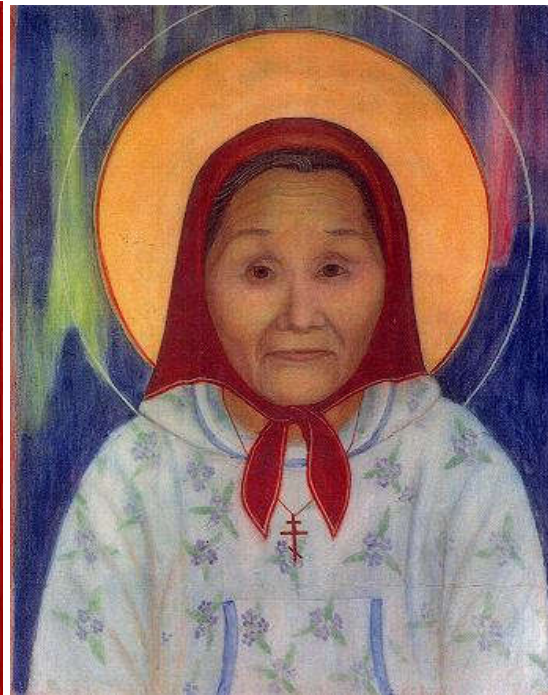
St Olga with Northern Lights Icon