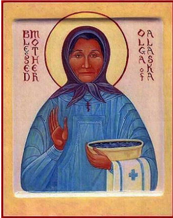
Matushka Olga Blue Joy Icon